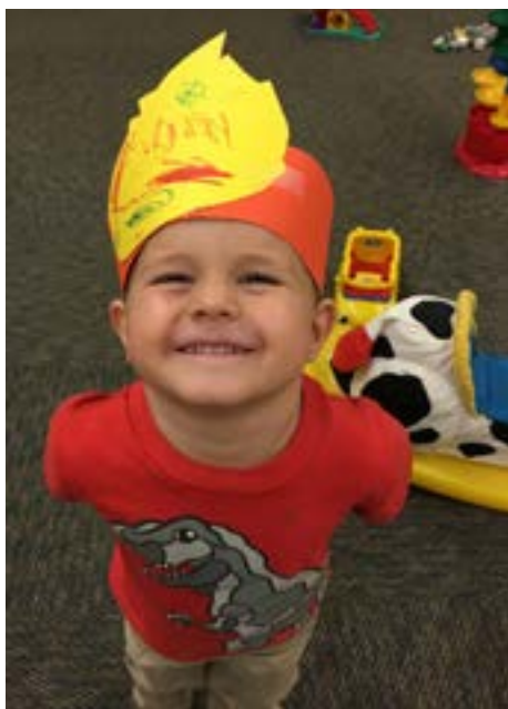
(2016 Preschool, Pentecost hat)

May 20, 2018 - Focus Scripture: Acts 2:1-21: Our lesson this week celebrates the gift of the Holy Spirit. What is God's Spirit helping our church to do?