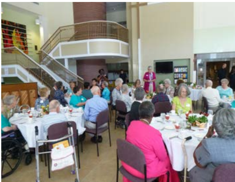
(Above: 2017 Homecoming Reunion)

The 4th Annual Homecoming Reunion is fast approaching on Thursday, September 13, 2018 at 11:00 am . The Reunion is an opportunity for members who are unable to attend worship on a regular basis to come for a time of fellowship and lunch. All members who would like to see friends they don't get to see on a regular basis are welcome to attend. There will be a brief worship service, followed by lunch (which will be provided by the Forum again this year!) Please call the church office at 317-251-9489 to RSVP by September 3rd .